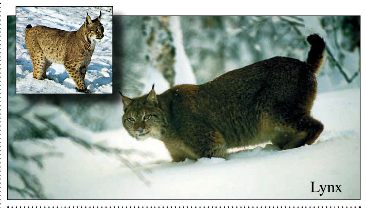
Table 3 shows mean, media and range of SUM PBDEs in lynx liver.