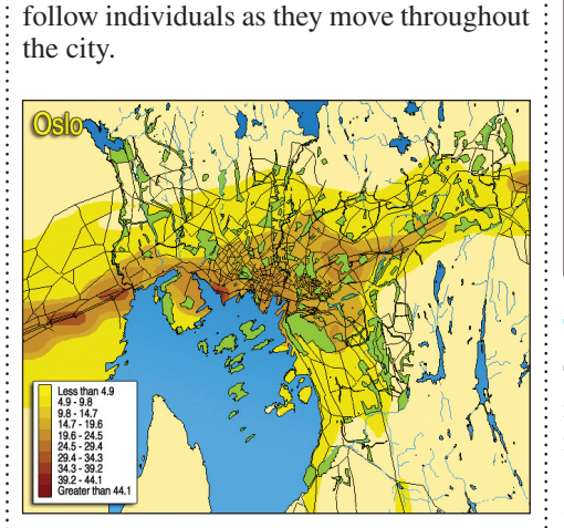
Fig.1 A GIS-generated map of particles in Oslo, Norway, shows that the concentrations follow the main roads.

The computer tool will be made user-friendly and compatible with tools currently in use. To demonstrate the new tool, an existing typical air quality management system is used. An output from such system can typically be in the form of a concentration map ( Fig. 1 ). As the system is GIS-based,